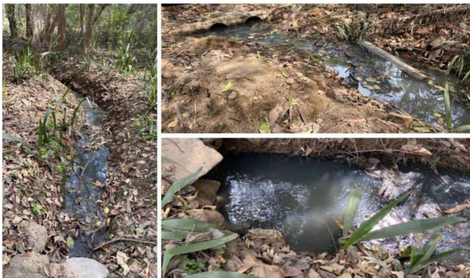
Figure 2 | Photos of the drain flowing through the TERI campus containing untreated sewage from nearby villages.

As shown in Figure 2, the wastewater is slightly discoloured and there is intermittent flow at the point of collection of wastewater. About 5,000 L of sewage flows every day from the village and is only naturally