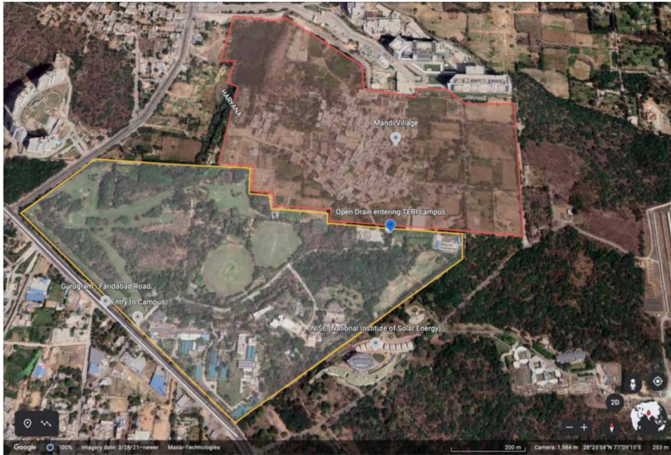
Figure 1 | Satellite imagery showing the location of Mandi village nearby the TERI campus and the open drain entering the TERI campus.

campus comprising of raw sewage, domestic, agricultural and veterinary wastewater. It may be considered as naturally aerated and follows the natural contour and drainage of the area with a horizontal span of 4–6 m within the campus (as shown in Figure 2). From this open drain, a grab sample was collected around Noon on a weekday, the sample was collected from the middle of the flowing stream at about 1.5 m depth with a simple 20 L Polypropylene jar. Water from the polypropylene jar was decanted into two 10 L glass bottles and sealed with a metallic cap ensuring that there was no space for air. Pilot testing on the TADOX ® plant on the same day and all samples were sent for testing and characterization to an accredited laboratory within 6 h in an ice box maintained at 4 °C.