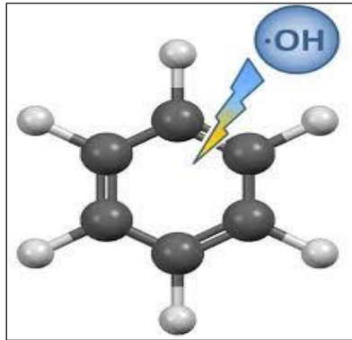
Fig. 1. Breaking of bonds of pollutant molecule by UV induced hydroxyl radicles

It is in this pursuit, The Energy and Resources Institute (TERI), New Delhi, has developed a novel technology called TERI Advanced Oxidation Technology (TADOX®), which provides treatment of wastewater stream containing high colour, COD, BOD, TOC, dissolved organics, micropollutants, non-biodegradable and persistent organic pollutants (POPs) in effluents from grossly polluting industries and municipal wastewater. TADOX® is under TERI's Patent (grant awaited) and also under various categories of trademark with the Trademark Office, Government of India. TADOX® involves UV-Photocatalysis as